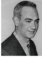
(A) O. P. Nayyar

10. The film "Tisari Manzil" marked the debut of a great music director. Can you name him?