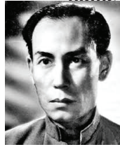
(B) S. D. Burman